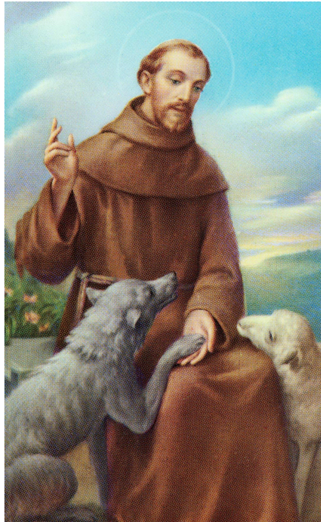
St Francis of Assisi with Wolf & Sheep