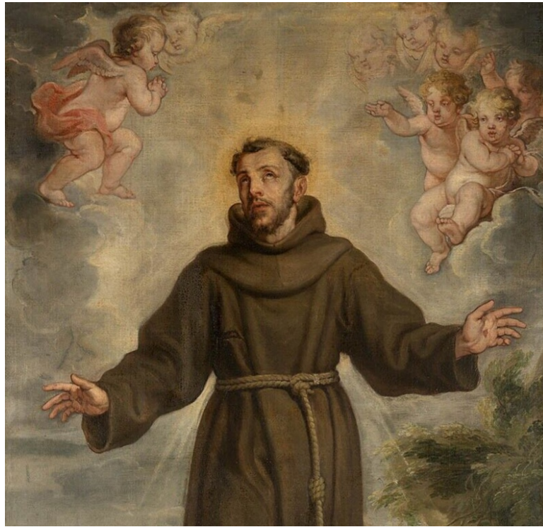
Portion of "Saint Francis of Assisi", Philip Fruytiers (17th century) Feast Day: 4 October